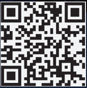
Watch the video