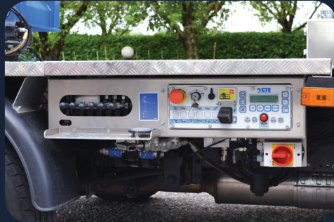
New ground controls